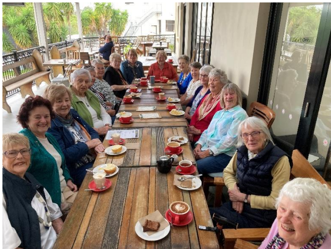
Ladie's morning tea at Driftwood Café/Milton